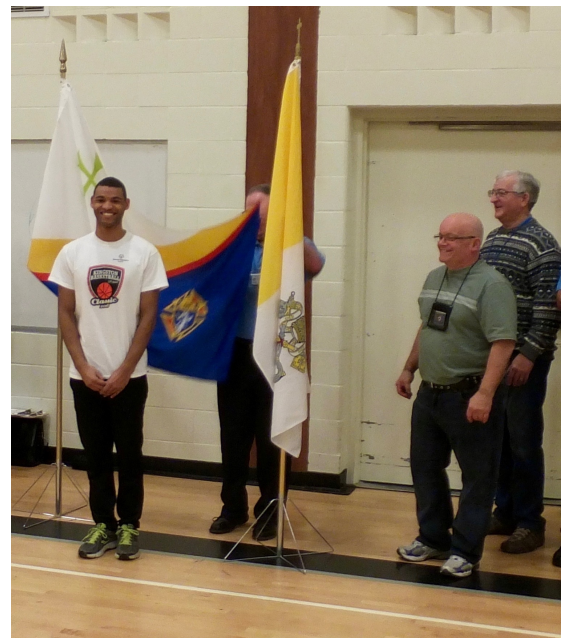
Knights assist at the basketball free-throw event in Oakville recently.